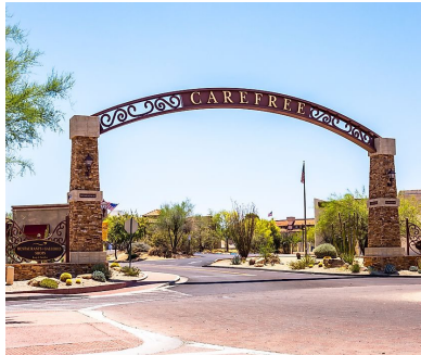
Arizona Desert Gardens and Sundial in Carefree, Arizona.

Just as its name suggests, Carefree is a laid-back desert town offering serenity and beautiful landscapes. Discover the beauty of the Sonoran Desert at the Carefree Desert Gardens, featuring a diverse collection of the desert's cacti and flora, as well as one of the world's largest sundials, the Carefree Sundial. Outdoor enthusiasts can explore the nearby Cave Creek Regional Park , which offers horseback riding, mountain biking, and hiking trails with panoramic views of the desert, especially at sunset.