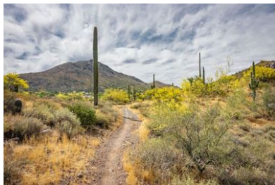
Land preservation is the most universal virtue in Cave Creek.