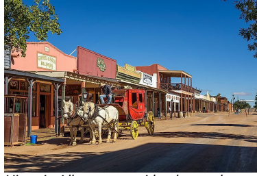
Historic Allen street with a horse drawn stagecoach in Tombstone.

Tombstone, Arizona, is famously known as "The Town Too Tough to Die" and is a captivating journey back to the Old West. This historic town, known for the infamous Gunfight at the O.K. Corral, is a living museum where history comes alive. Visitors can walk the same streets as legendary figures like Wyatt Earp and Doc Holliday, with reenactments of the gunfight performed daily. The Tombstone Courthouse State Historic Park offers a detailed look at the town's legal history, while the Bird Cage Theatre provides a glimpse into its more rowdy past.