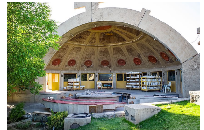
The Ceramics Aspe in Arcosanti.

Arcosanti is a neat architectural experiment located in the high desert of central Arizona offering a glimpse into the future of urban living. Designed by visionary architect Paolo Soleri, Arcosanti is an ongoing project that aims to create a self-sustaining community integrating architecture with ecology. Visitors can take guided tours to learn about Soleri's innovative design principles and the project's history. The site hosts