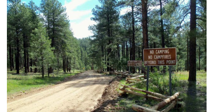
Coconino National Forest will be under Stage 1 fire and smoking restrictions starting Thursday.

PHOENIX – Three national forests plus Arizona State Trust lands in multiple counties will go under Stage 1 fire restrictions on Thursday morning, authorities said.