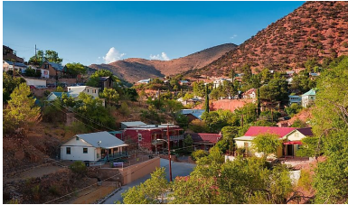
Overlooking Bisbee, Arizona.

Bisbee, perched high in the Mule Mountains of southern Arizona, is an artist's haven brimming with character. Once a bustling mining town, Bisbee has transformed into a quirky, picturesque community known for its well-preserved historic architecture and colorful artistic nature. The Copper Queen Mine offers guided tours that delve into the town's mining heritage, while the Bisbee Mining & Historical Museum provides further insight into its storied past.