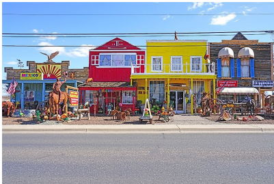
The historic Old Town of Cottonwood, Arizona.

Located in the heart of Verde Valley wine country, Cottonwood blends nature with historic charm and a thriving arts scene, making it one of the most beautiful places to visit in Arizona. The historic Old Town district is a highlight, with its quaint shops and art galleries, including the enchanting Hart of AZ Art Gallery, where visitors can view art and pieces by local artisans. The town is also part of the Verde Valley Wine Trail, featuring several wineries, including the Arizona Stronghold Vineyard Old Town Cottonwood Tasting Room.