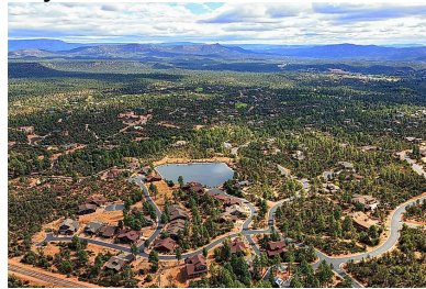
View of the Mogollon Rim from Payson, Arizona.

Nestled in the scenic Mogollon Rim country, Payson is a charming mountain town known for its outdoor beauty and rich Native American history. Surrounding the town is the Tonto National Forest, which offers more than 2.9 million acres of scenic hiking trails, fishing spots, and camping areas. The forest is home to diverse vegetation and landscapes, allowing visitors to hike along stunning Pinyon-Juniper and Ponderosa Pine trees, explore breathtaking vistas along the Mogollon Rim, or enjoy fishing in the Verde River. In town, outdoor enthusiasts can enjoy scenic hikes on the Payson Area Trails System, with views of Gibson Peak and Steward Canyon.