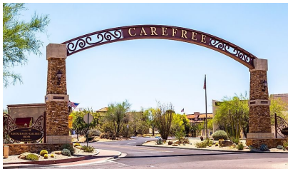
Carefree, Arizona Desert Gardens and Sundial.

Carefree Arizona lives up to its name with a relaxed, laid-back atmosphere perfect for a tranquil escape. Known for its stunning desert scenery and charming downtown area, Carefree offers a mix of natural beauty and cultural attractions. The Carefree Desert Gardens, located in the heart of downtown, feature a variety of native desert plants and picturesque walking paths. Visitors can explore the town's shops, art galleries, and dining establishments, or attend one of the many annual events such as the Carefree Fine Art & Wine Festival.