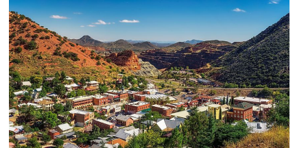
This historic mining town of Bisbee, Arizona.

Tucked away in the picturesque Mule Mountains, Bisbee is a charming town known for its vibrant arts scene and beautiful architecture. Once a bustling mining town, Bisbee's narrow streets are now lined with colorful Victorian-style homes framed by the rugged mountains, providing enchanting views for visitors in 2024. Located in the heart of downtown is the historic Copper Queen Hotel. Whether spending the night or just enjoying the hotel's saloon and restaurant, the Copper Queen Hotel showcases the town's old-world charm. Visitors can also stroll along Brewery Gulch to view the town's artistic beauty, stopping at the Old Bisbee Brewing Company for a refreshing pint and views of local art along the Bisbee Art Wall.