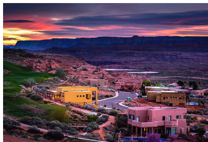
Page, Arizona, at dusk.

Tombstone's Allen Street is lined with saloons, shops, and restaurants, all maintaining an authentic 19th-century feel. The annual Helldorado Days festival, featuring parades and reenactments, celebrates the town's wild and storied history. Page