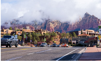
Downtown Sedona, Arizona, with mountains in the background.

Known for its stunning Red Rock formations and charming downtown, Sedona is one of Arizona's picturesque small towns for those seeking both relaxation and adventure. One of the best spots to view nature in Sedona is at Red Rock State Park, which offers several trails showcasing the fiery Red Rock vistas and stunning sunset views. More hiking adventures await along the Bell Rock Loop Trail and Chimney Rock Trail, where outdoor enthusiasts have the chance to view hot air balloons in the western sky in the early mornings.