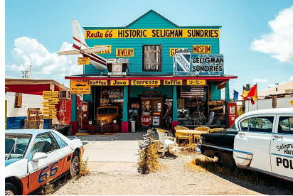
Seligman, Arizona: Famous town on Route 66.

While Seligman may be underappreciated, you may recognize it. The small town has a big place in American pop culture history and is known as the birthplace of Historic Route 66. The town exudes a nostalgic atmosphere, with its colorful retro motels, diners, and shops that pay homage to the golden age of American road trips. Visitors can stop by the Route 66 Motorporium and the iconic Snow Cap Drive-In, both filled with memorabilia and quirky charm.