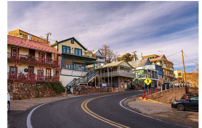
Cityscape view of Jerome, Arizona.

For some of the most breathtaking views in Arizona, visit the former mining town of Jerome in 2024. Perched on a hillside overlooking the Verde Valley, Jerome offers visitors a glimpse into the region's mining past alongside natural beauty and a vibrant arts scene. The town is known as "The Wickedest Town in the West" due to its lawless past during the copper mining boom in the 1800s. Today, Jerome's haunted history can be explored through Jerome Ghost Tours and a visit to the Haunted Hamburger, where ghosts have been sighted. Nearby, art enthusiasts can explore the town's artistic side at galleries like the Jerome Artists Cooperative Gallery and Pura Vida Gallery.