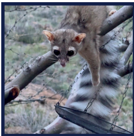
RINGTAIL

This month, we are learning all about the Ringtail ( Bassariscus astutus ). Here are some fun and key facts: