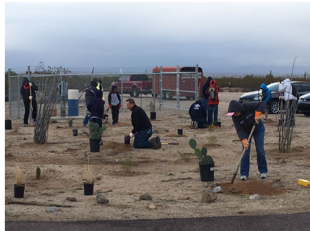
San Tan Revegetation Project, 2016

Our definition of a successful volunteer program means we foster a sense of community where people can connect with nature in a manner that has meaning, purpose, and value... a community where everyone plays a part in protecting our precious, local natural resources. In the spirit of service, volunteers use their gifts and talents to benefit Maricopa County Parks in new and unique ways. These gifts extend far beyond our Department and reach the greater community in service to many of our community partners and constituents