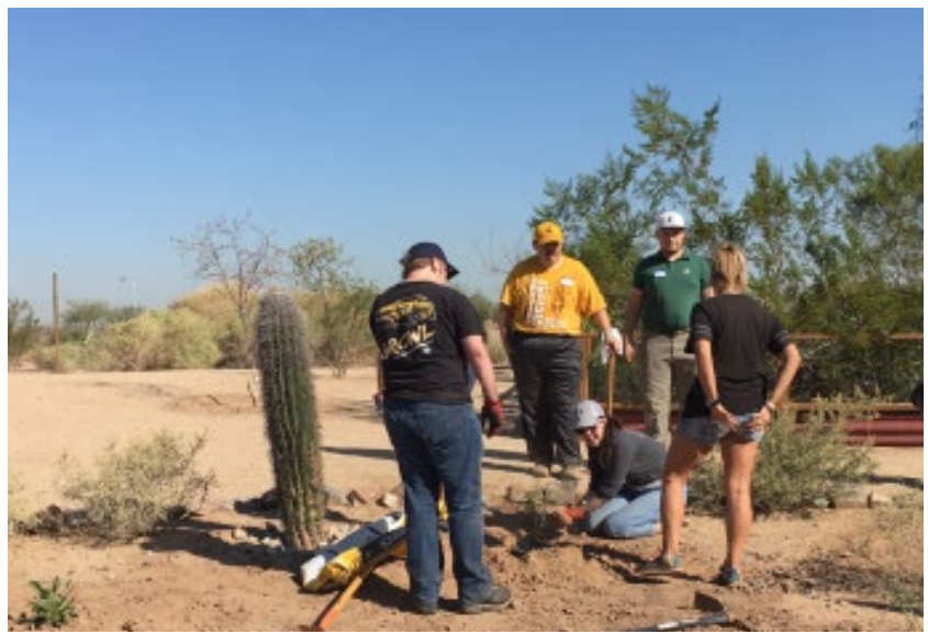
Estrella Pollinator Garden, 2016