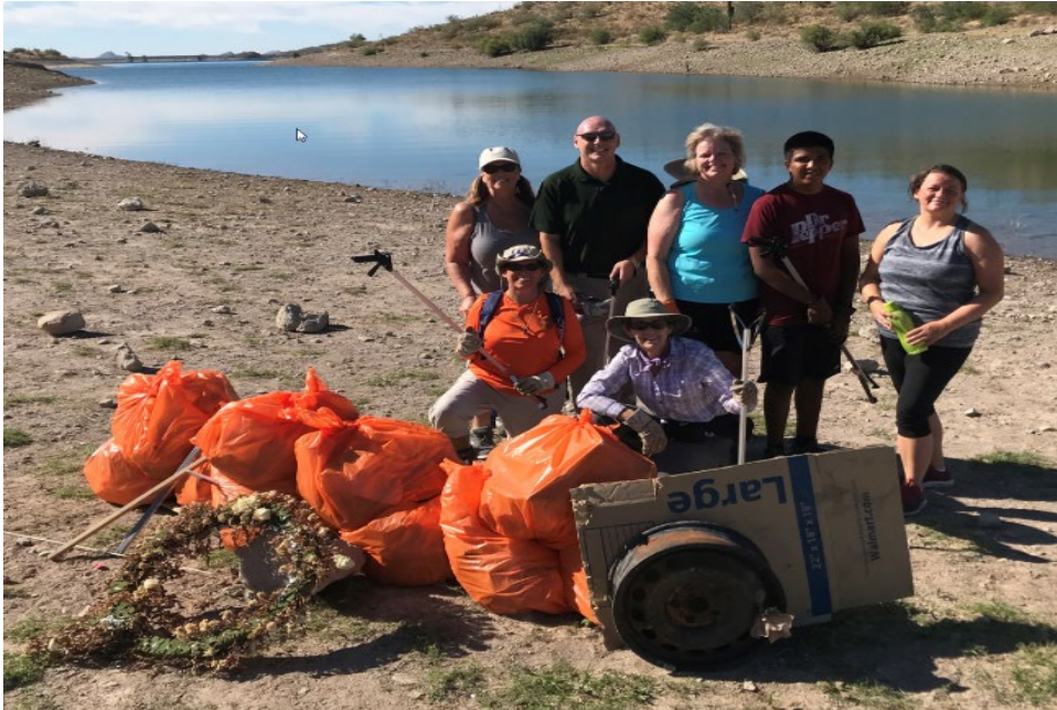
Lake Pleasant Trash Clean-up, July 2019